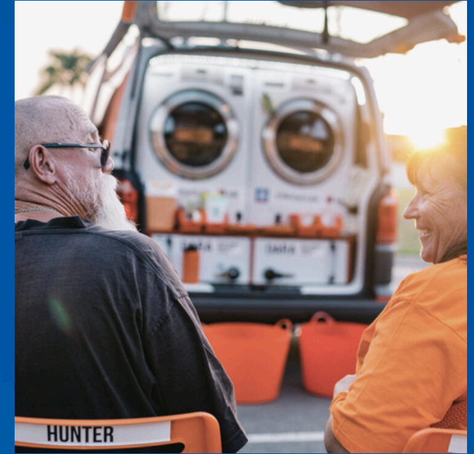
ORANGE SKY LAUNDRY Mobile laundry service for the homeless